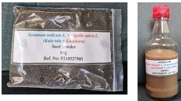
Figure 1. (a) Seeds of Sesamum indicum L. and Nigella sativa L. (b) Decoction made out of both seeds

Preparation of research drug: Seeds of S. indicum and N. sativa were purchased from an Ayurvedic drug supplier in Colombo district, Sri Lanka. The plant materials were identified, washed, dried, and decoction prepared (Figure 1) according to Ayurveda Pharmacopeia (Anonymous, 1994).