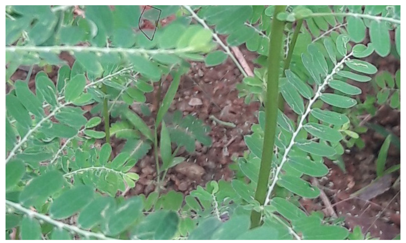
Fig. 1. The photograph of Phyllanthus niruri Linn.

-itored in terms of inhibition of virus induced cytopathogenicity in MT-4 cells. The alkaloid extract of the plant revealed suppressing activity on strains of HIV-1 cell cultured on MT-4 cell lines. Furthermore, the selectivity index was found to be 13.34 representing clear selective toxicity of the extract for the viral cells (Naik and Juvekar, 2003).