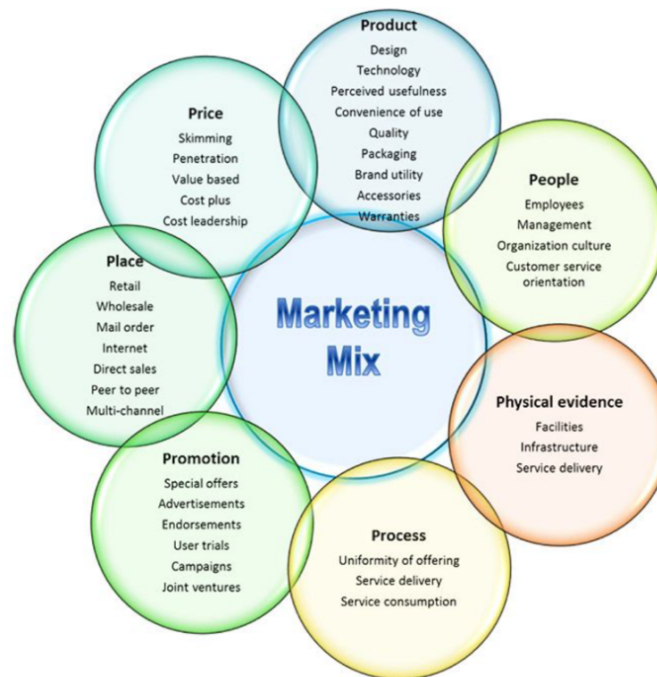
Figure 01: Marketing Mix