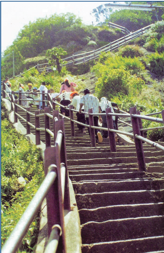
A Group of Ascending Pilgrims