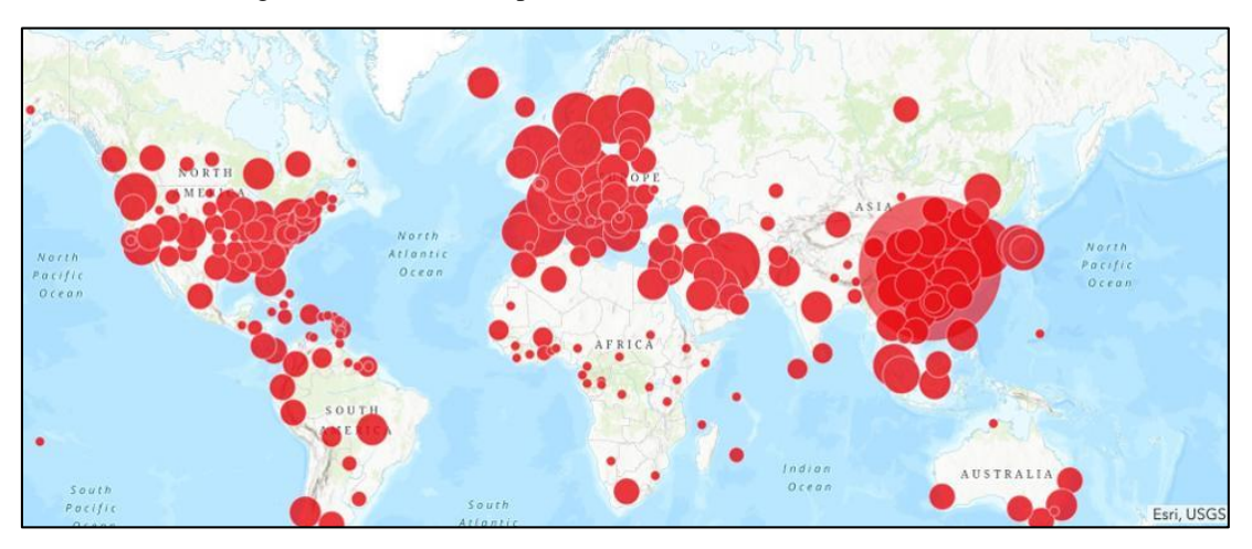
Figure 2.1: Clustering and spread of COVID 19 all over the world

According to the figure 2.1, it is much clear that most of the COVID 19 clusters are identified associated with the urban agglomerations of developing countries where most of the vulnerable areas have highly impacted from all its socio economic aspects. The impacts of COVID 19 o urban agglomerations which need more managerial solutions are discussed in the next section.