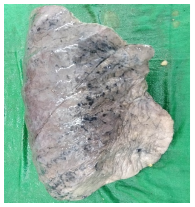
Figure 2. Absent horizontal fissure