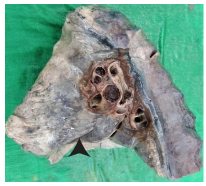
Figure 1. Inferior accessory fissure [black arrowhead].

A total of 24 lungs in 12 cadavers were studied. Male: female ratio was 1:1. The age of the cadavers ranged from 34 to 86 years. The anatomical variations of major lung fissures and lobes in the study population and a gender-based contingency table are provided in Table 1 and Supplementary Table 1, respectively. Inferior accessory fissures were noted in one right and one left lung of two different cadavers [Figure 1]. Two cadavers had no horizontal fissures [Figure 2], and one left lung had an incomplete oblique fissure posteriorly [Figure 3]. Azygos lobe was not observed in this study sample.