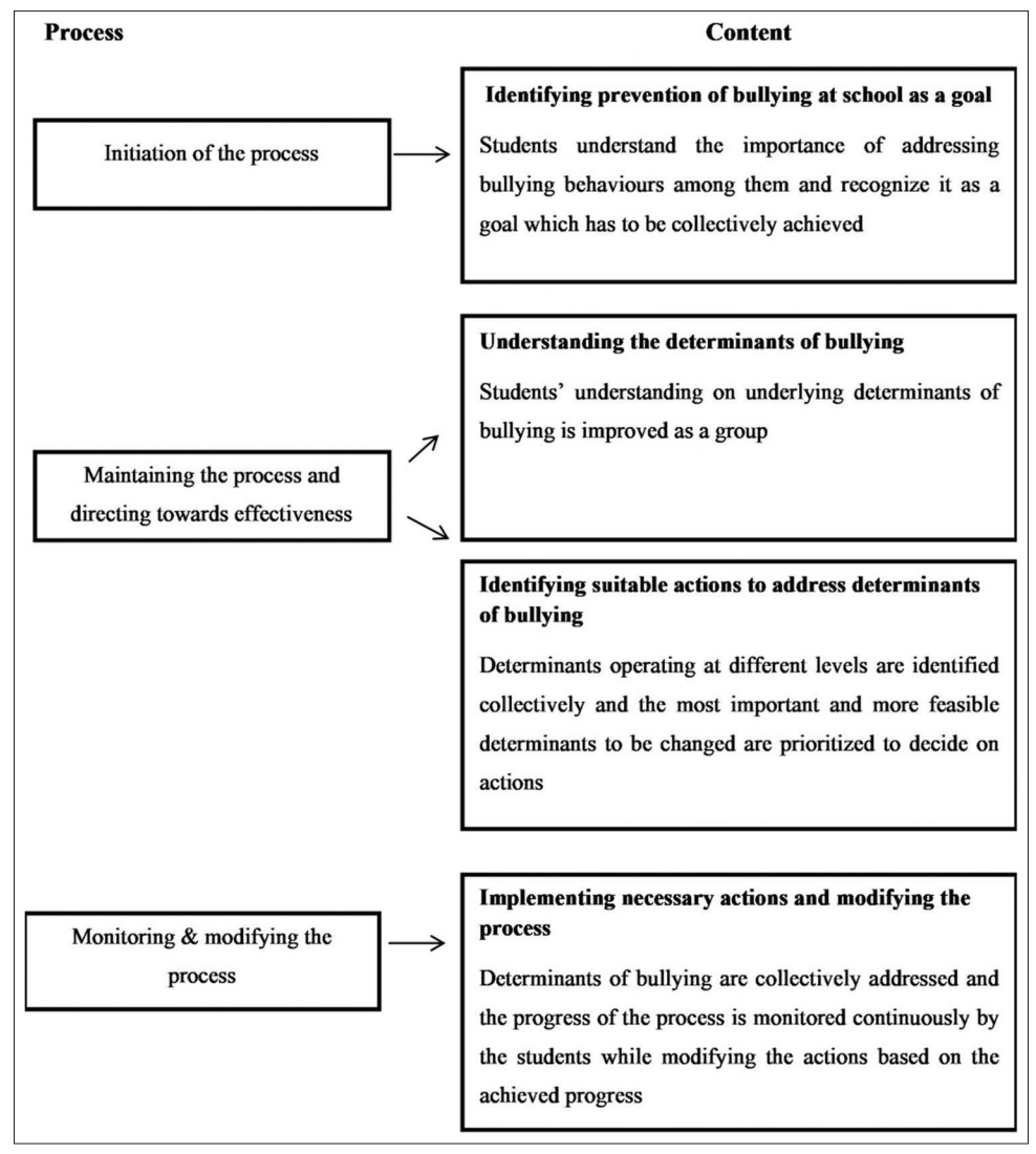
Figure 2: Conceptual framework for the process of addressing bullying among students