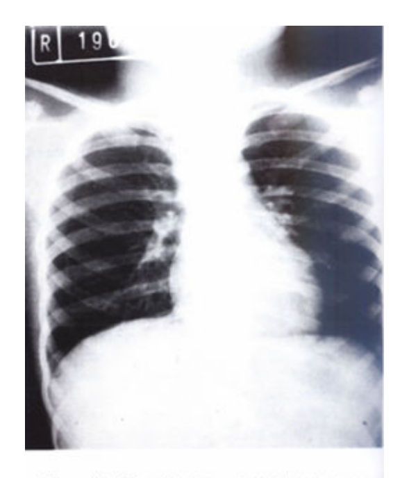
Figure 2. On admission - normal chest x-ray

On arrival at the Lady Ridgeway Children's Hospital he appeared well with no evidence of superior vena caval obstruction clinically or radiologically (Figure 2). The erythrocyte sedimentation rate was 22 mm 1st hour. The Mantoux test was positive (20 mm). White cell count and platelets were present in normal numbers in the peripheral blood. The haemoglobin was 10g/dl. Bone marrow showed hypo-plastic granulopoesis with all stages of maturation, normal erythropoesis and thrombopoesis and no infiltration by lymphoma or tumour cells. Macrophages were increased in number and activity, indicating chronic infection or inflammation.