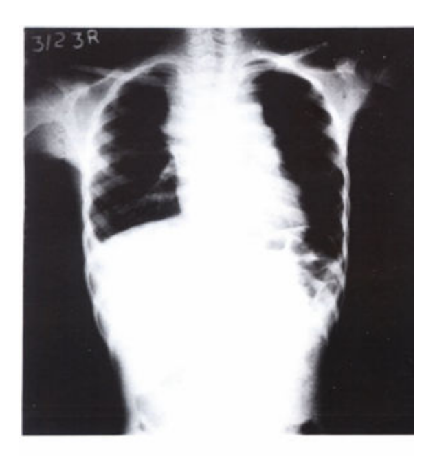
Figure 1. Prior to transfer – widened superior mediastinum

An 11 year old boy developed breathlessness over 12 days and was admitted to the local hospital with facial oedema and engorged neck veins. He had been "less active" and "feeling unwell" for one month. His father had been diagnosed and treated for pulmonary tuberculosis in the past year. Chest x ray showed a superior mediastinal mass (Figure 1). To relieve increasing respiratory difficulty he had been administered intravenous hydrocortisone 100 mg six hourly for 2 days followed by oral dexamethasone 4 mg six hourly for 6 days eight days prior to transfer to Colombo.