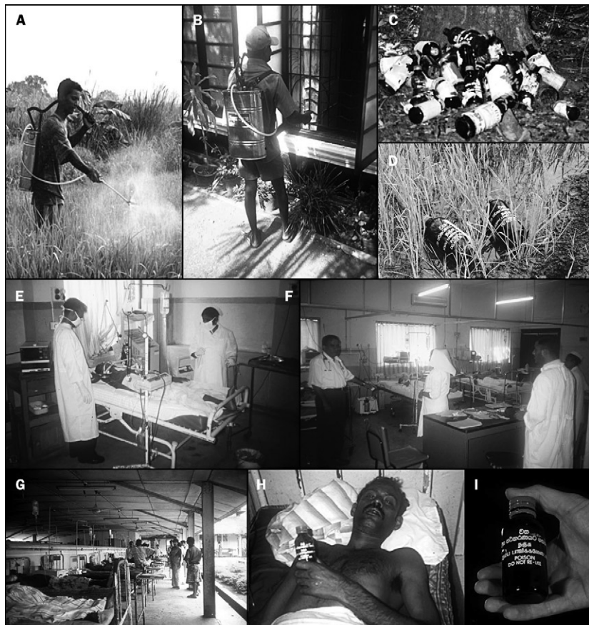
Figure 1: Causes and effects of pesticide poisoning

The pesticide industry states that it now fully supports a policy of restricted use of pesticides within an integrated programme of pest management. 19 However, its view of such management differs from that of some workers in that it perceives a clear need for pesticides in most situations. 20 Furthermore, its practice of paying salespeople on a commission basis, with increased sales being rewarded with increased earnings, is unlikely