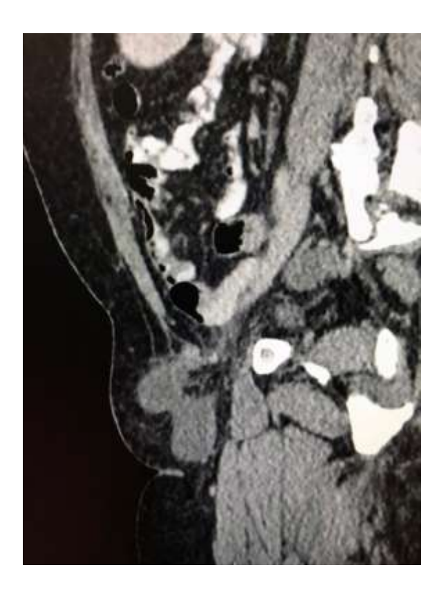
Figure 2 : Coronal section of the contrast CT image showing a hydrocele of the Canal of Nuck on right inguinal region.

Figure 1: Axial section of the contrast CT image showing a hydrocele of the Canal of Nuck on right inguinal region. (HU – Hounsfield Units)