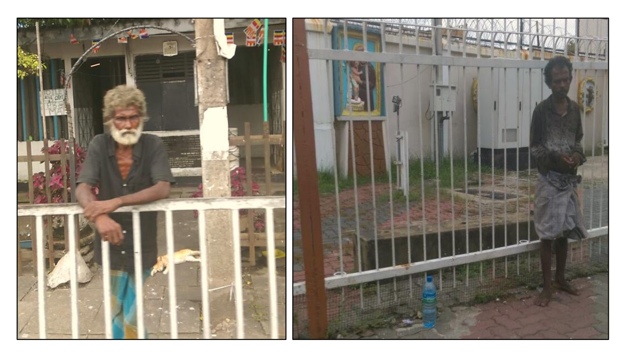
Figure 6. Identified and interviewed homeless

According to the focus group discussion, the elders of the study area say" Most of the elders are being abandoned by their children. They might be in good status but couldn't give welfare for their parents who had faced lots of troubles while rearing them." A social worker said that "Taking care of the children and youngsters doesn't easy as we think. They used to live in such a carefree environment. So, take care of them in homes giving extra works for the nanny's and social workers". As they said, the homelessness is a major problem that cannot be cut down easily. The problem is about both human well-being, basic needs and economical fulfill.