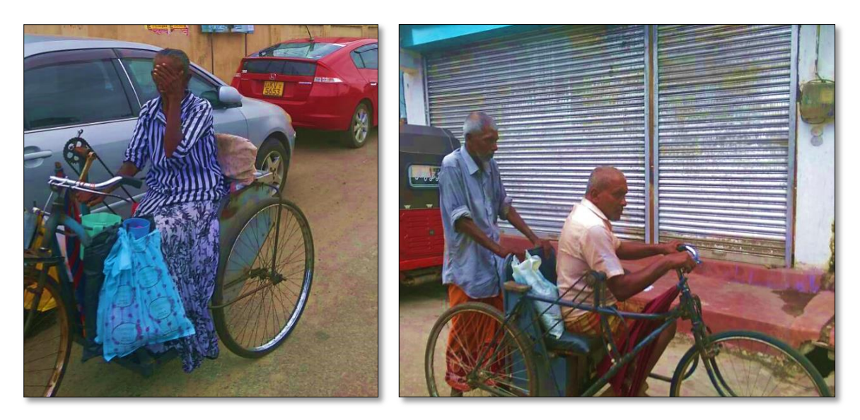
Figure 4. Identified Disable homeless people on the road