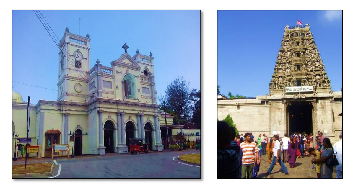
Figure 5. Worship places in Kochchikade

Homelessness is a social problem in developed and urbanized cities. Hundreds of people including children, families, babies and the elderly live day after day without proper meal and sanitation. There more people who are mentally ill also roam around the city roads, which can be extremely confusing to them, and dangerous to the rest of society. These problems needs to be solved soon and should be addressed as a major crisis that is affecting whole society.