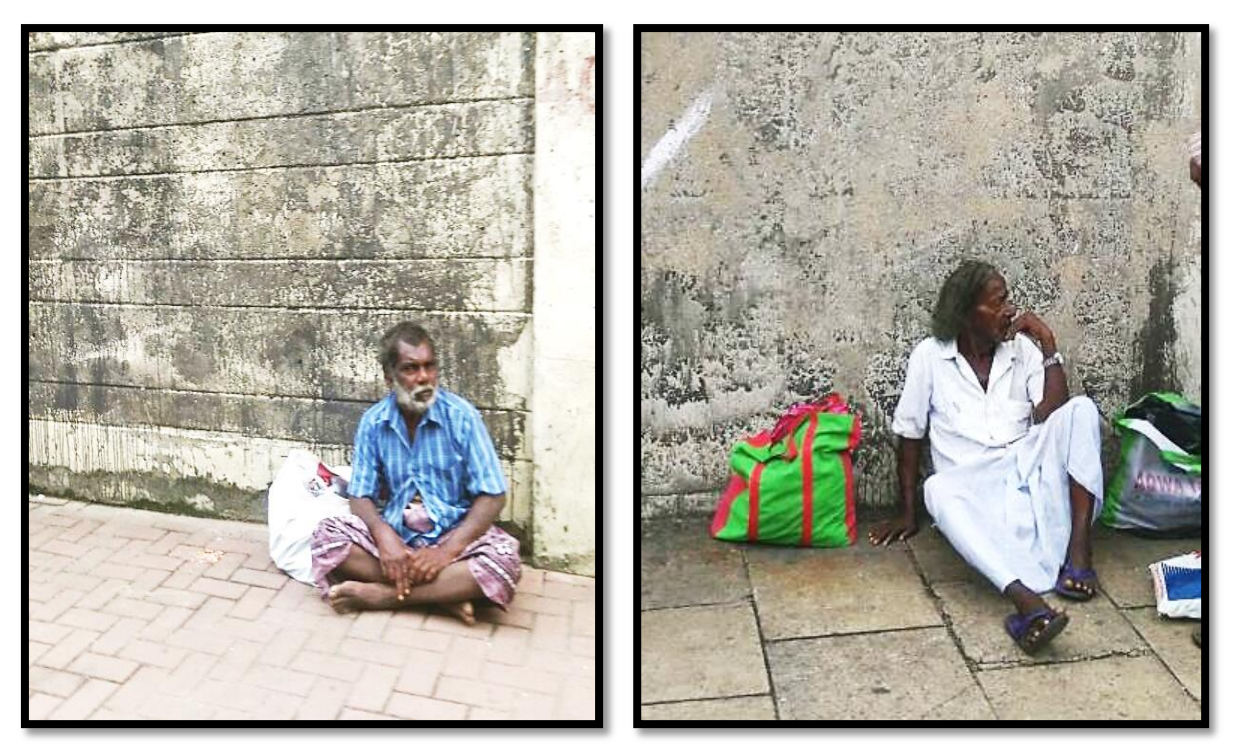
Figure 3. Identified Homeless people near to the Church (St. Anthony)

The identified homeless people in the study area doesn't have any of the above basic needs. Most of them were from cities and down town areas or rural areas.