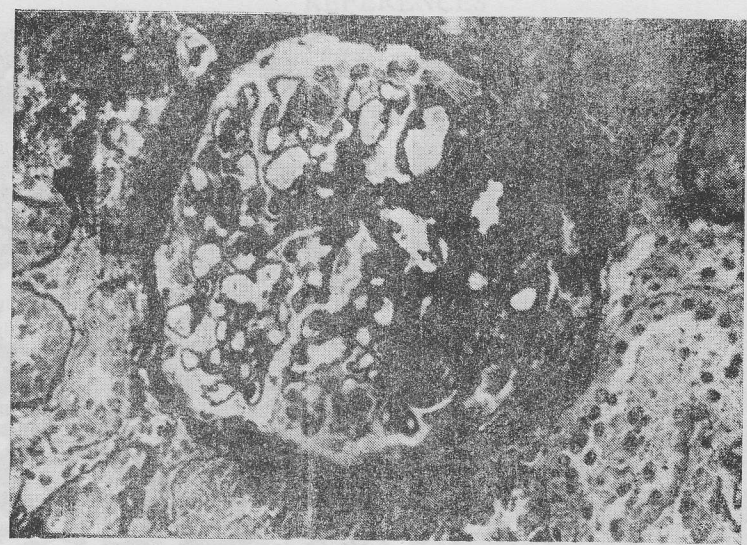
Fig. 3. Section of glomerulus stained with PAS/Silvermethanamine showing focal segmental glomerulo nephritis (X 400).