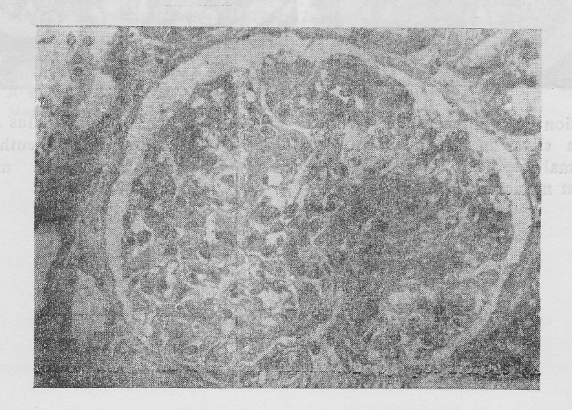
Fig. 4. Section of glomerulus stained with haematoxylin and eosin showing increased tuft cellularity and infiltration by polymorphs (X 400).