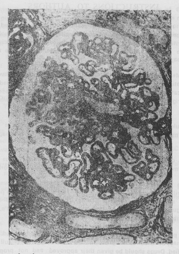
Fig. 5. Section of glomerulus stained with silvermethanamine showing thickened capillary basement membranes with "spikes" (X 400).