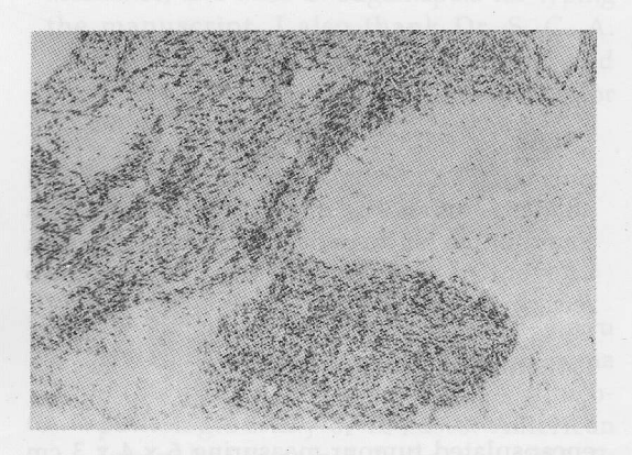
Fig. 2. Pseudolobular appearance with cellular nodules and oedematous less cellular areas (x 100)

The cysts seen macroscopically are due to collection of oedema fluid in between the solid areas of the tumour.