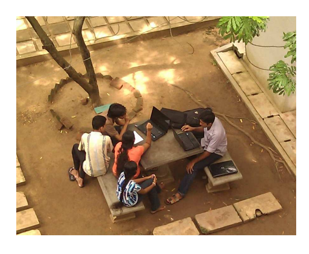
Figure 1: Informal peer group discussion under a tree

uate studies, they had just two such opportunities to have informal peer group discussions because of nonavailability of vacant lecture halls. Further, at times students arrange these discussions with a very short notice and then they do not have much time to search for a suitable location. Therefore, they used to have these discussions in locations such as cafeterias, students common rooms, pavilions, or even under trees where they used to have their social gatherings.