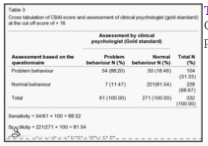
Table 3Cross tabulation of CBAI score and assessment of clinicalpsychologist (gold standard) at the cut off score of > 16

For this sample the positive predictive value at this cut off point was 51.92 and the negative predictive value was 96.92 (Table (Table3).3). The area under the ROC curve was calculated as 0.949 (95% confidence interval is 0.926-0.972). This shows that the instrument can satisfactorily discriminate the children having behavioural problems from those with normal behaviour.