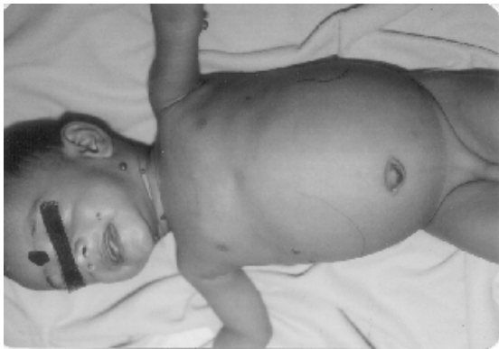
Figure 1. Diffuse cutaneous haemangiomas

A seven month old baby boy from Heyyanthuduwa (Gampaha district) presented with multiple cutaneous haemangiomas. The child is the second product born to non-consanguineous parents. He was delivered vaginally at Kandy Teaching Hospital, at 32 weeks of gestation. Birth weight was 1.75 kg. and perinatal period was uneventful. The child developed multiple haemangiomas on face and trunk during the late neonatal period (Figure 1). Although medical advice was sought, they were reassured. There were no other dysmorphic features